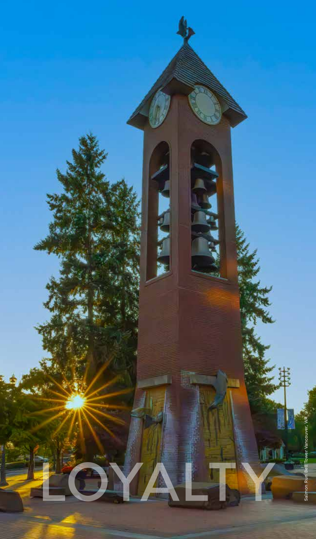
Salmon Run Bell Tower Vancouver, WA