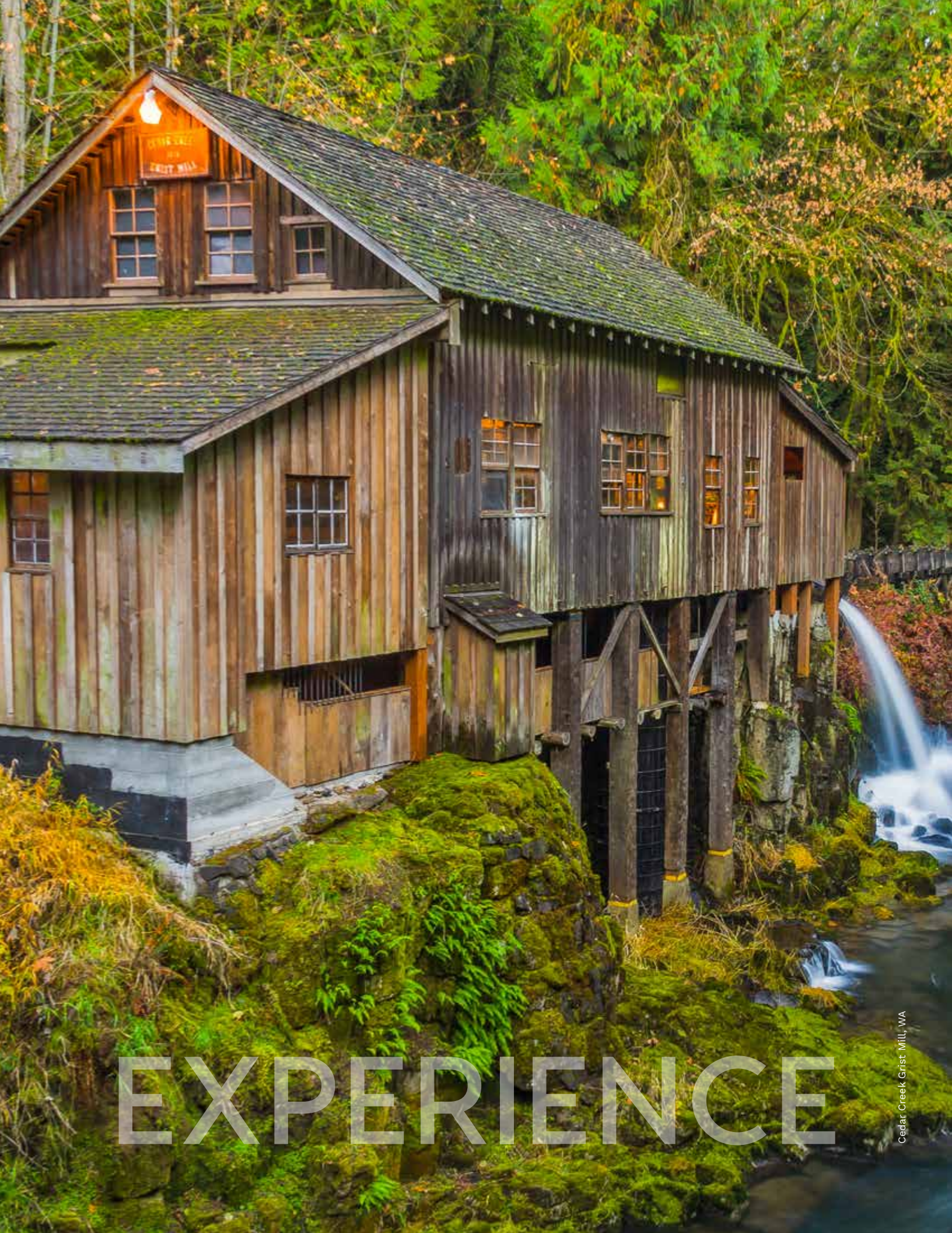
Cedar Creek Grist Mill, WA