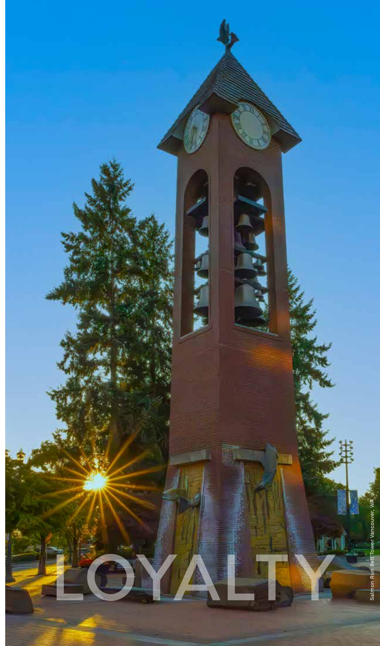
Salmon Run Bell Tower Vancouver, WA